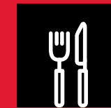
Table of 10 Included