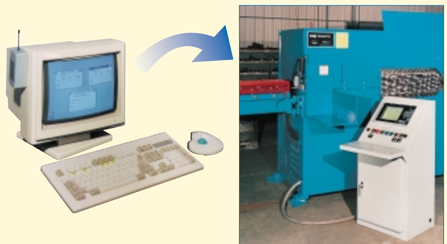
Figure 4: A bending machine controller obtains information directly from the office database